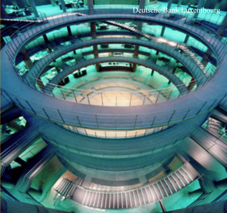
Deutsche Bank Luxembourg